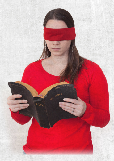
Will We Stop Neglecting the Bible?

The Bible is the most unusual book of all time. It isn't man's book about God. It's God revealing the truth about Himself and about us. It tells us of our sin and of His grace and mercy in Christ. It also tells us how God wants us to live in this world. It is "a lamp" for our feet and "a light" for our path (Psalm 119:105). But just as the money we have in the bank is of no value to us if we don't access it, so the Bible has no value to us if we don't access it through careful reading and diligent heeding.